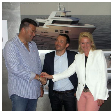
Laying of the keel