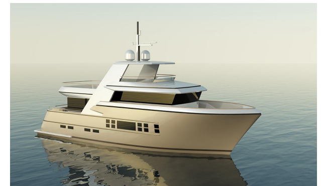
Drettmann Explorer Yacht 24 M

The Explorer, designed by Drettmann Yachts and Focus Yacht Design, based on the specifications and built in accordance with the CE A regulations with a round steel hull and aluminium superstructures, will feature diesel-electric POD drive systems. It has been designed for a top speed of 13 kn and a maximum range of 5,000 sm. This also applies to the generously dimensioned storage space, which is required for long sea voyages. The garage for a Williams 445 tender, a SeaDoo RXP are maintained in the forecastle below the raised main deck and are launched with the use of a 1.2 t crane. As a result, the space common on motor yachts of this size at the aft of the bottom deck can be used for a beach club with a lounge and sauna directly next to the swimming platform. The three cabins for the owner and guests are arranged amidships – precisely where the passengers are ensured to have the calmest sleep during their voyage. The crew quarters with their own passageway to the wheelhouse will connect to the forecastle. In order to dampen vibrations and reduce noise, the floors, ceilings and walls will be mounted in a flexible manner.