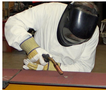
A coin as lucky charm

business and was able to move things ahead in this aspect. For instance, additional engineers were hired, which now in collaboration with the assembly staff construct the entire complex pipe work of the large motor yachts as well as their engine rooms up to the smallest detail with 3D software. This increases the efficiency during construction and ultimately leads to a higher motivation of the assembly personnel.