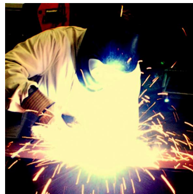
The owner welds the steel himself